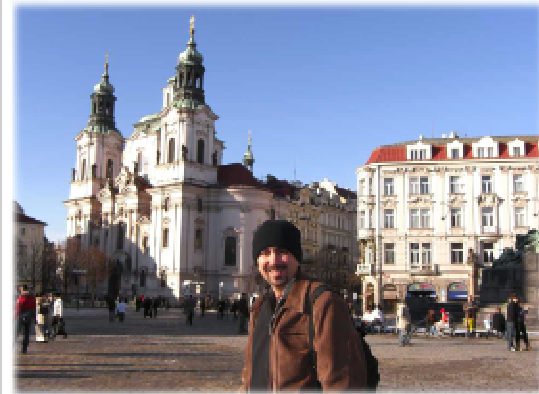
Prague, Czech Republic