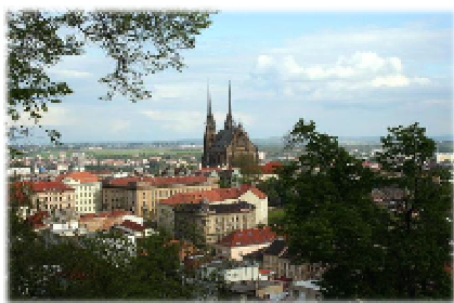
Brno, Czech Republic