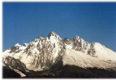
High Tatras, Slovakia