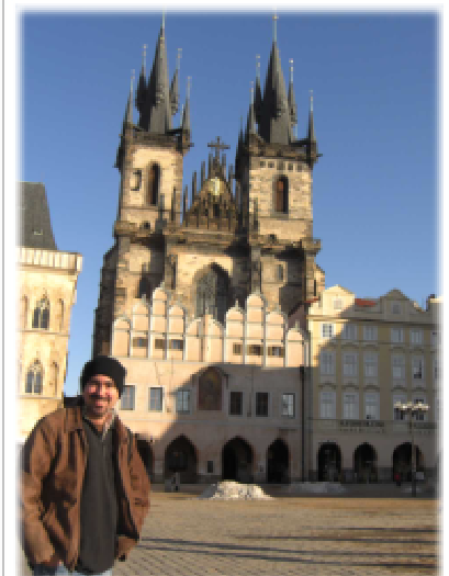
Prague, Czech Republic