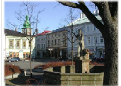
Frenstat, Czech Republic