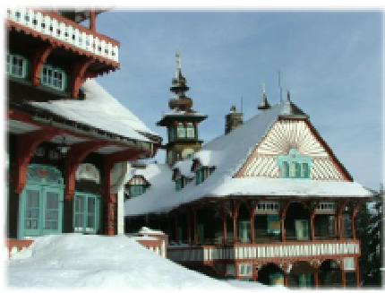
Zlin, Czech Republic